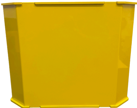
Inside of Riser