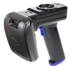
3138 Bluetooth UHF RFID Reader with High Gain Antenna