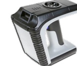
3166 Bluetooth Rugged UHF RFID RAIN Reader