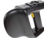
2128L Bluetooth UHF RFID Reader with High Gain Linear Antenna