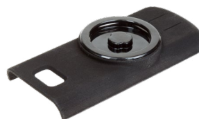
The 1128-PL Pop-Loq Slide-On Adapter

Click here for more information on Pop-Loq mounts.