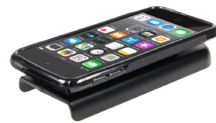
1128-MNT-IPOD7G with iPod Touch (7th Gen) inserted

To see our full range of Slide-on Mounts, visit www.tsl.com/slide-on-mounts .