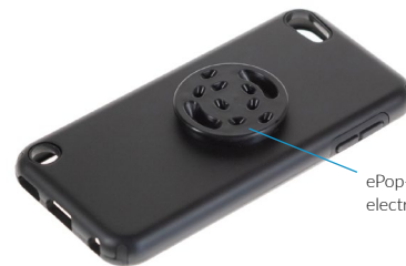
ePop-Loq stud (without electrical contacts)