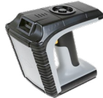
1166 Bluetooth Rugged UHF RFID RAIN Reader