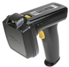
1128 Bluetooth® UHF RFID RAIN Reader

Click on your reader to below for more information on your mounting options.