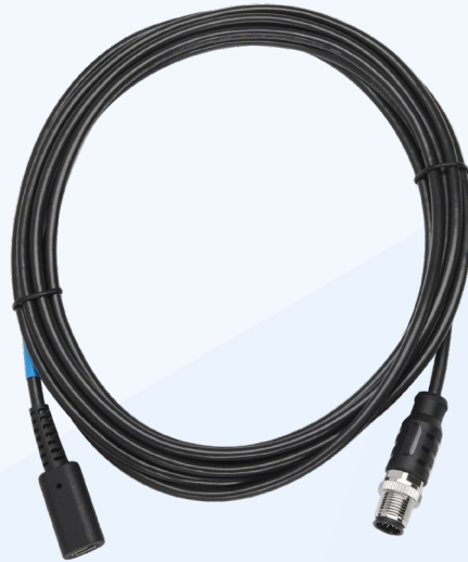
M12 to USB-C Female Receptacle Host Cable, 3.5 meter