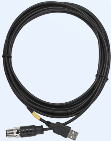
M12 to USB-A Male Client Cable, 1.5 meter