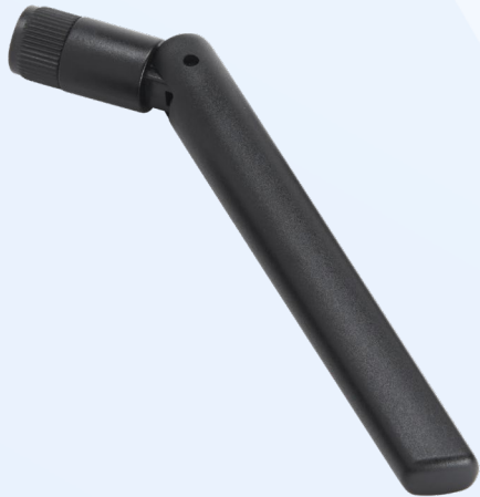
Articulating Outdoor IP67 Sealed WLAN Antenna, 124 mm, SMA Connector