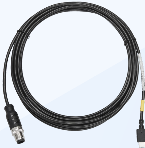
M12 to USB-C Male Client Cable, 3.5 meter