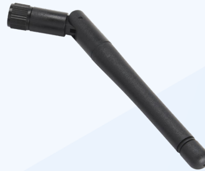
Articulating Indoor WLAN Antenna, 109 mm, SMA Connector