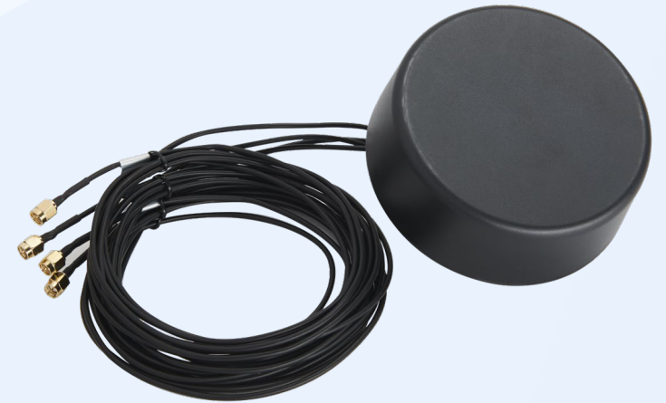
FXR90 4G/5G/GPS Antenna, 1 Meter Cable, 4x SMA Male Connectors, Black*

*Required for Cellular and/or GPS operation