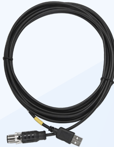
M12 to USB-A Male Client Cable, 3.5 meter