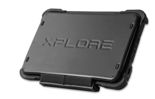
Keyboard in closed position via magnets, protecting display glass