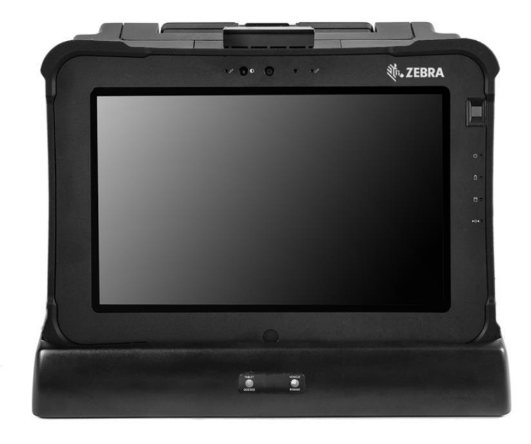
Part Numbers: Contact Zebra for product availability

Even mobile workers need to be in the office at some point. With the Office Dock, it is easy to transform your Zebra L10 rugged tablet into a full desktop configuration complete with HDMI and VGA video connections; 2 USB 3.0 ports, 2 USB 2.0, headphone, mic, and Gigabit Ethernet. Charge a spare standard battery or extended battery in the optional battery charger. The 90 watt AC adapter ensures both the tablet battery and the spare battery charge simultaneously. The L10 office dock has tablet alignment features designed for easy, one-handed insertion into the dock, and the dock can be securely mounted to the desk. (Compatible with all L10 Platform models)