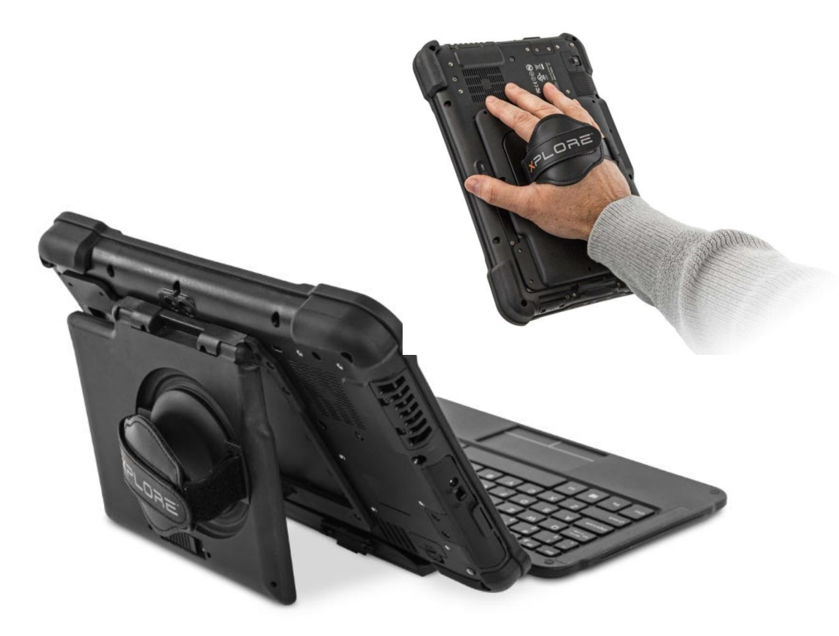
Part Numbers: 410055 (L10 KickStrap kit)

This combined Kickstand and Rotating Hand Strap provides working comfort for all Zebra L10 rugged tablet models in the field and at a desk. The integrated Kickstand closes tightly when workers are on the move, enabling access to the Rotating Hand Strap, which can be adjusted for hand size as well as unique rotation angle.